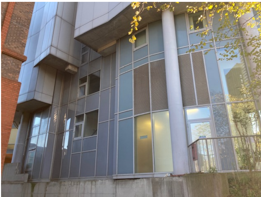
Figure 49a: lower element of Altitude facing Croydon Park Hotel (below floors 3 to 8)

An additional photograph should be added after Figure 49a as below: